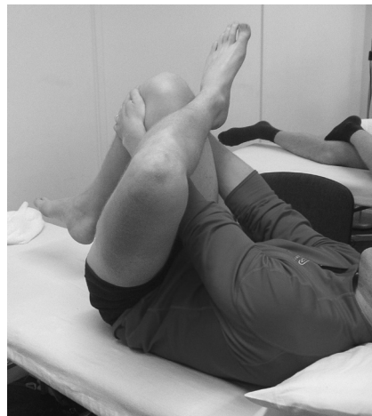
Fig 1.12: Stretching piriformis in lying - right knee is bent to 90 degrees. Left hip in abduction and medial rotation.