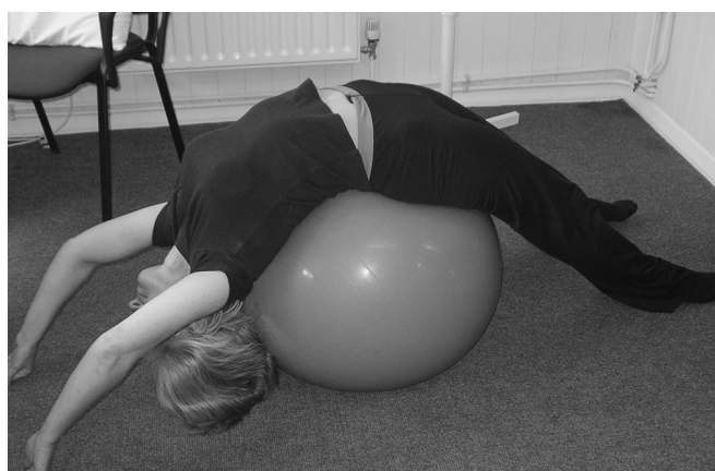
Fig 1.6: Advanced abdominal stretch with Swiss ball