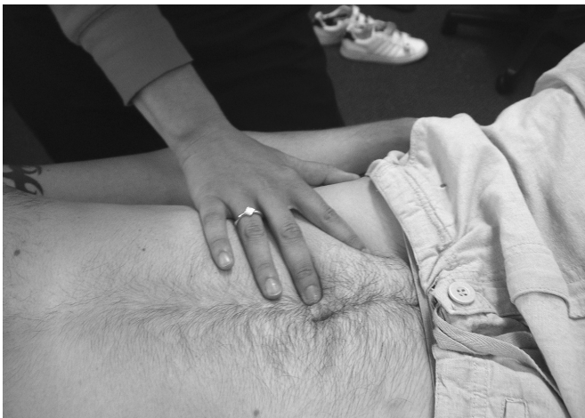
Fig 1.9: Palpation of the external abdominus oblique