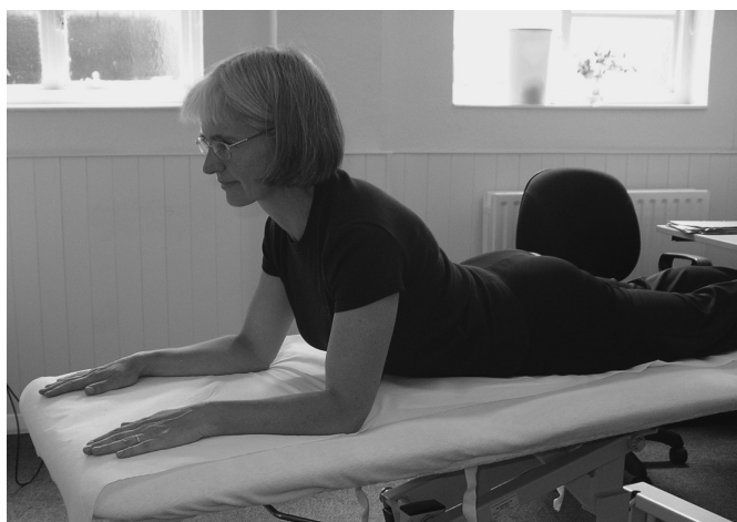
Fig 1.4: Early abdominal stretch