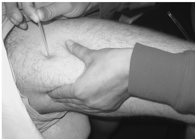
Fig 1.14: Needling adductor longus