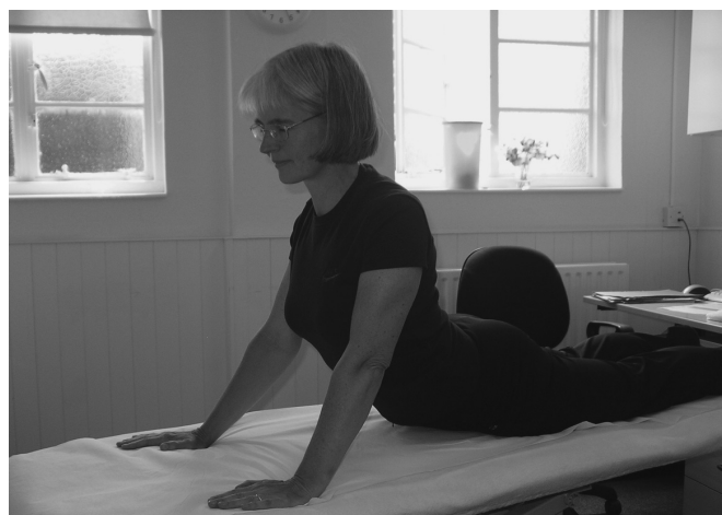
Fig 1.5: Intermediate abdominal stretch