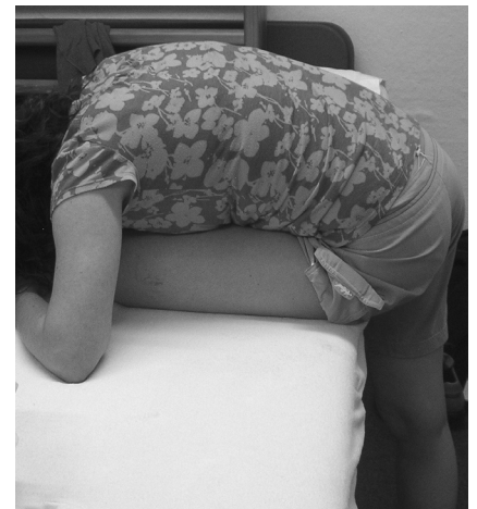
Fig 1.13: Stretching piriformis in standing - right hip is laterally rotated, left hip is abducted. Body weight is over the left hip.