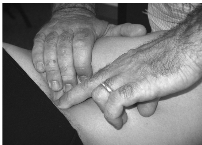
Fig 1.16: Manual palpation of pectineus

For some patients, the iliopsoas may cause direct nerve entrapment due to a shortened psoas. The iliohypogastric, ilioinguinal, lateral cutaneous and femoral nerves all emerge from the lateral border of the psoas major muscle; the obturator nerve emerges from its medial border. Entrapment of the genitofemoral nerve caused by taut TrPts in the psoas can cause pain and paraesthesia in the groin, scrotum or labia and in the proximal anterior thigh (Ingber, 1983). If there are distal sensory changes in the thigh, or muscle weakness in the knee and hip, the practitioner should suspect specific nerve involvement (Gerwin, 2005). The psoas major and iliacus muscles originate in the retroperitoneal basin and thus cannot be needled. A major portion of both muscles lies in the retroperitoneal space and is known to stimulate a number of intra-abdominal pathological conditions such as appendicitis, gynaecological disorders and femoral or inguinal hernia.