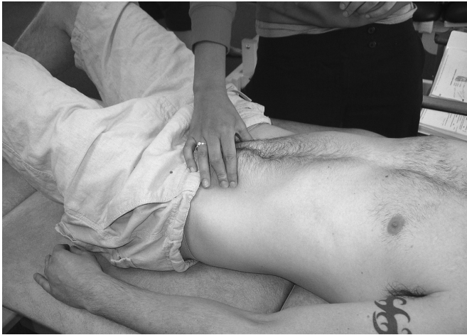
Fig 1.7: Palpation of rectus abdominus