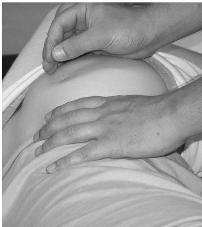
Fig 1.11: Needling piriformis - needling is directed towards the symphysis pubis within the sciatic notch.