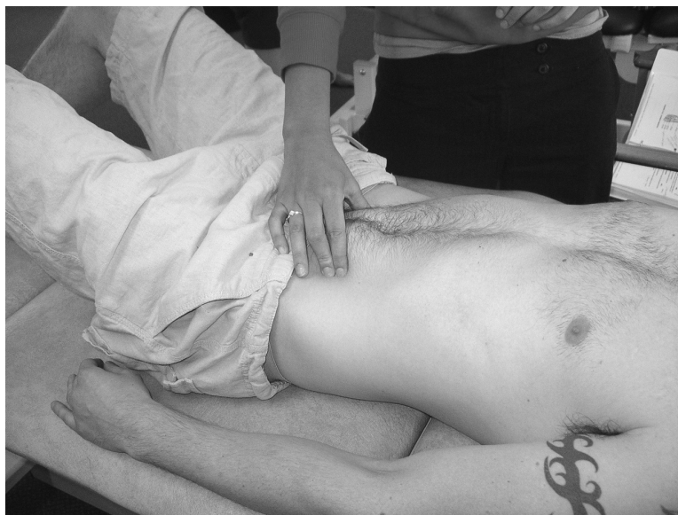
Fig 1.2: Abdominal palpation technique

Emotional stress can lead to dysfunction in the ANS resulting in smooth muscle spasm and compression of the ovarian and uterine veins, with an associated increase in the amount of substance P found at the endothelium of pelvic veins, which is thought to