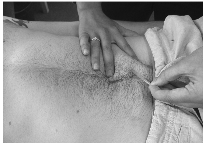
Fig 1.10: Needle application for external abdominus oblique, needling superficially in a medial to lateral direction with the fingers used to lift the muscle.