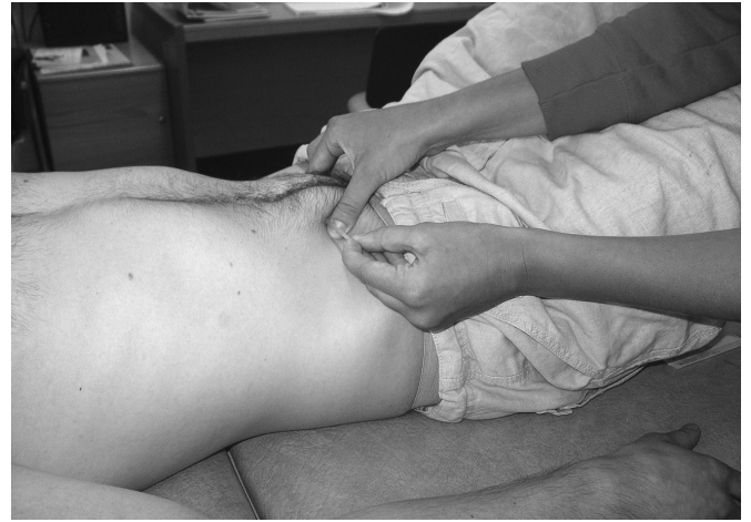
Fig 1.8: Needle application for rectus abdominus, directed superficially across the muscle fibres with the muscle pinched to avoid underlying viscera.